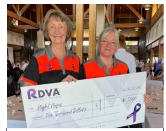
A donation for Night Ninjas