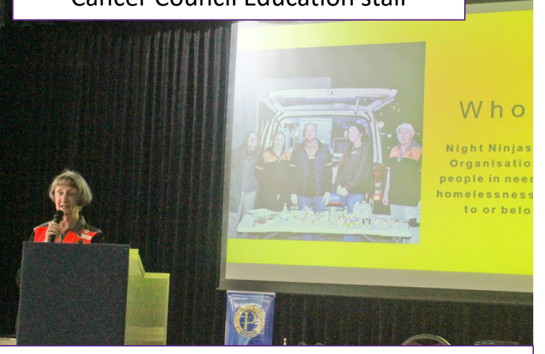
Night Ninjas presentation at a Probus group