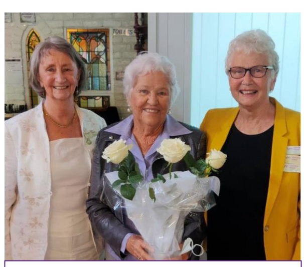
Forum's 80th birthday party